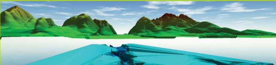
Display of multiple surfaces in the 3D View

Global Mapper's powerful 3D Viewer allows any 3D data, including LiDAR point clouds, digital elevation models, and 3D vector features to be rendered in stunning 3D. This customizable oblique view offers a truly realistic perspective within either a full-screen view or docked side-by-side with the corresponding 2D map. Capture the 3D view as an image file or as a fly-through video recording.